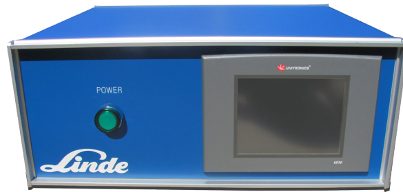
Spot Cooling Controller